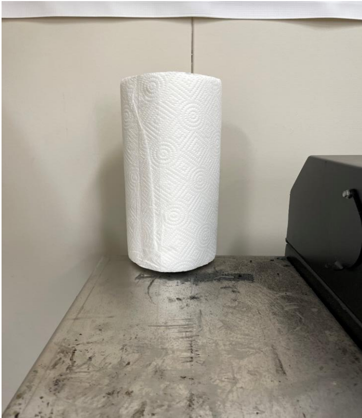
Insert paper towel roll to Part A