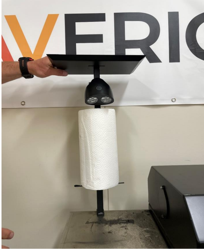
Attach Part C to Part A