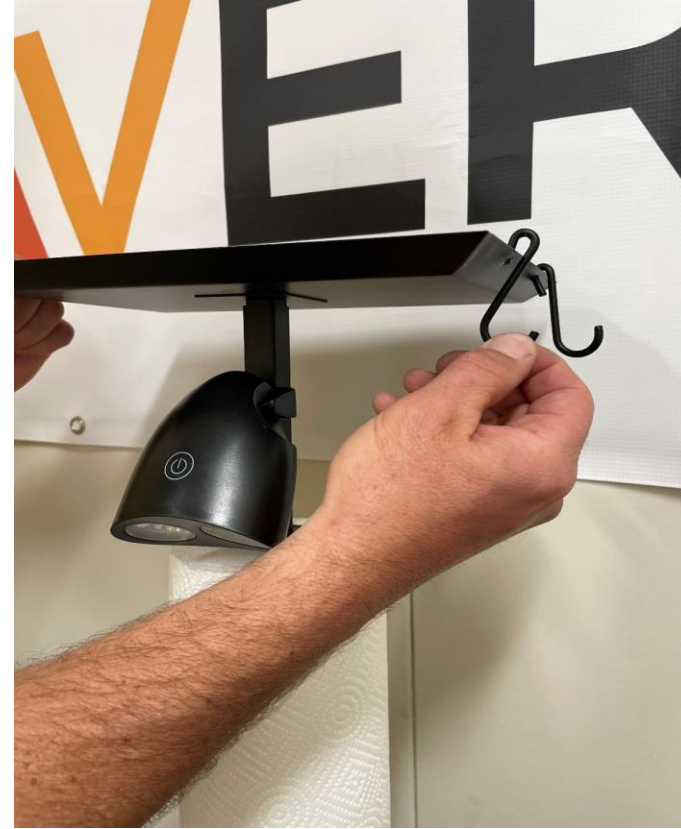
Insert hooks (Part E) to Part C