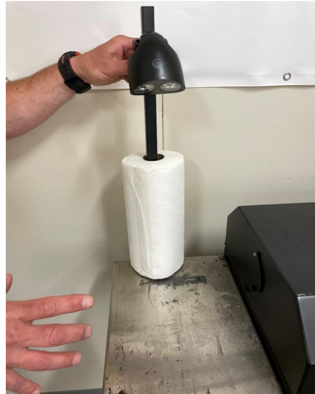
Attach part B into part A