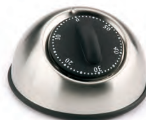
TM-07C STAINLESS STEEL MECHANICAL TIMER 60 Minute Timer