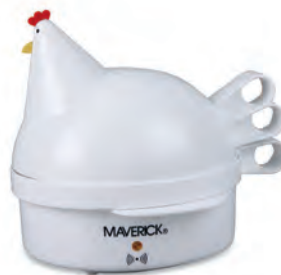
SEC-2 HENRIETTA HEN EGG COOKER Soft, Medium or Hard Boils up to Seven Eggs Poaching Tray for Four Eggs Chirps when Eggs are Ready