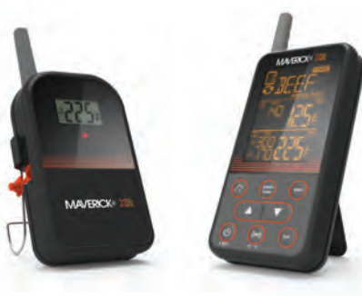
XR-40 EXTENDED RANGE WIRELESS BBQ & MEAT THERMOMETER 500 Ft Range With Insta-Sync™ Technology Dual High Heat Probes for BBQ and Food +32°F to +572°F / 0°C to +300°C