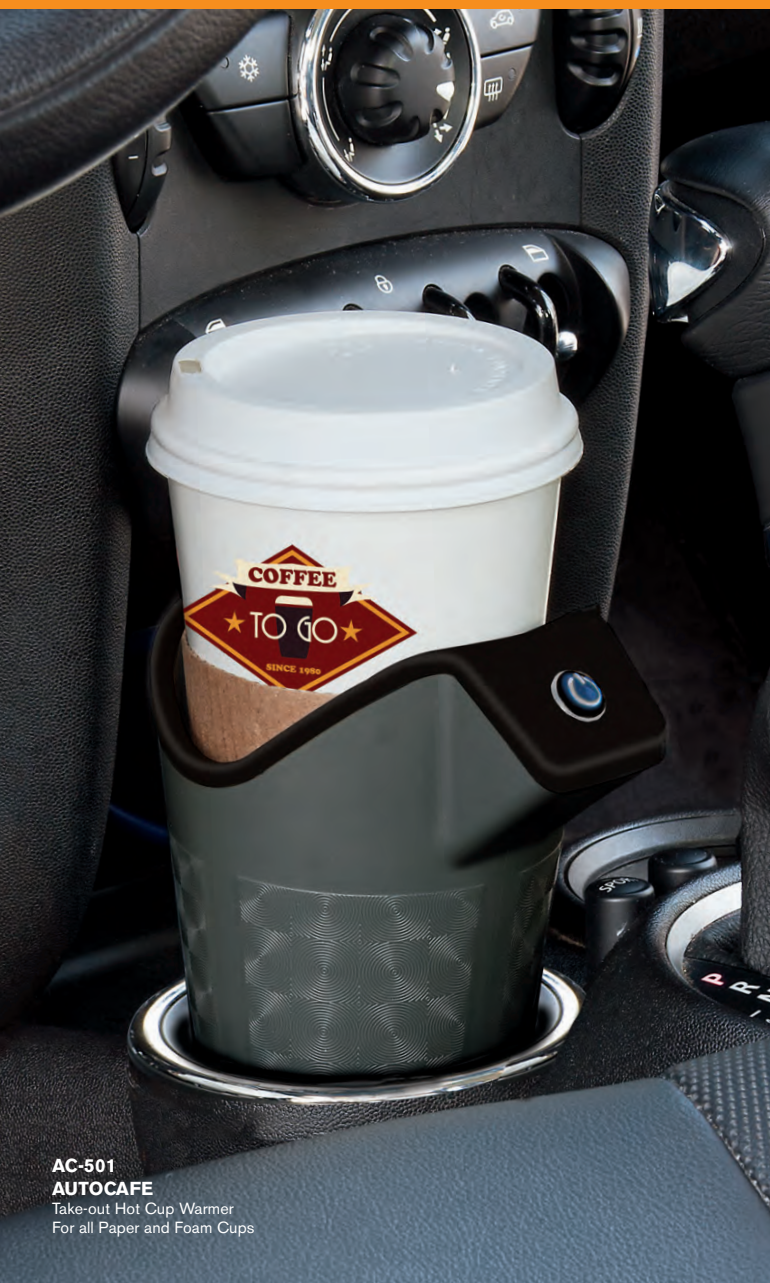
AC-501 AUTOCAFE Take-out Hot Cup Warmer For all Paper and Foam Cups