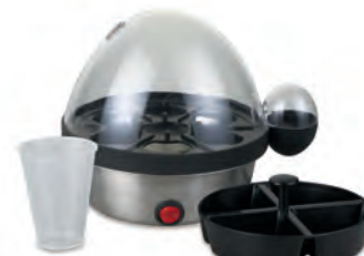
EC-200 STAINLESS STEEL EGG COOKER Soft, Medium or Hard Boils up to Seven Eggs Measuring Cup Included Poaching Tray for Four Eggs