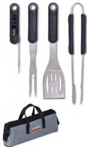
AK-75 BBQ TOOL SET WITH INSTANT-READ THERMOMETER