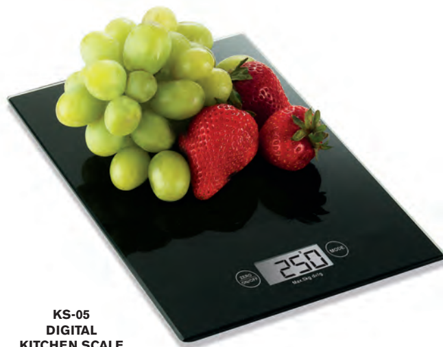
KS-05 DIGITAL KITCHEN SCALE Tempered Glass Top 11 lbs. Capacity