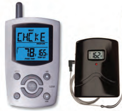
ET-706 WIRELESS BBQ & MEAT THERMOMETER 300 Ft Range Dual Hybrid High Heat Probes for BBQ and Food +32°F to +572°F / 0°C to +300°C Also Available in Black