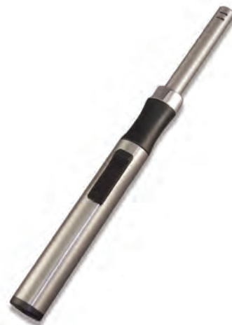
BL-01SS BBQ LIGHTER Refillable Butane Tip Extends from 1.5" to 2.75"