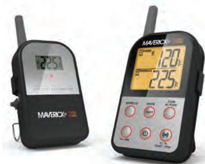
XR-30 WIRELESS BBQ THERMOMETER SET 500 Ft Range Dual High Heat Probes for BBQ and Food +32°F to +572°F / 0°C to +300°C