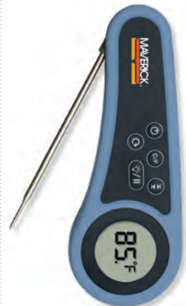
PT-55 THE RAIN DROP WATERPROOF DIGITAL THERMOMETER

Select Right or Left Hand Display -40°F to +660°F / -40°C to +348°C