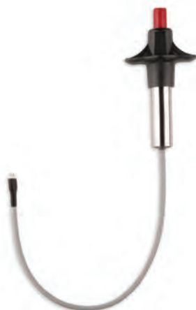
BL-02 PIEZO LIGHTER WITH FLEXIBLE TIP