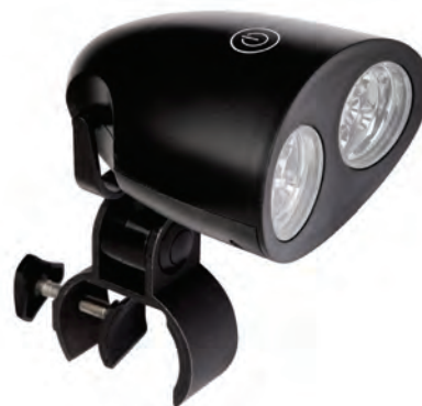
GL-320 10 LED GRILL LIGHT