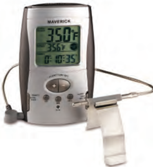
OT-03 DIGITAL OVEN THERMOMETER Computes Average Oven Temperature +122°F to +572°F / +50°C to +300°C