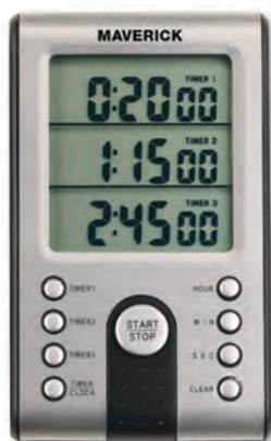
TM-03 THREE LINE DIGITAL TIMER Count Down/Count Up 99 Minute, 59 Second Timer