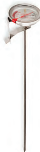
CT-05 LONG PROBE DEEP FRY THERMOMETER +100°F to +500°F / +38°C to +280°C