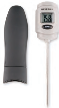
DT-12C POCKET PEN DIGITAL PROBE

Fast & Accurate Thermocouple Sensor -4°F to +572°F / -20°C to +300°C