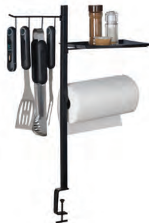
AO-01 BBQ ACCESSORY ORGANIZER