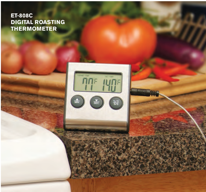
ET-808C DIGITAL ROASTING THERMOMETER