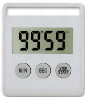
TM-233 PROMOTIONAL DIGITAL SINGLE LINE TIMER 99 Minute, 59 Second Timer