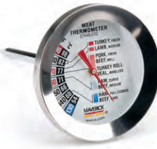
RT-01 LARGE DIAL ROASTING THERMOMETER Color Prompts for Type of Meat Doneness +130°F to +190°F / +54°C to +90°C