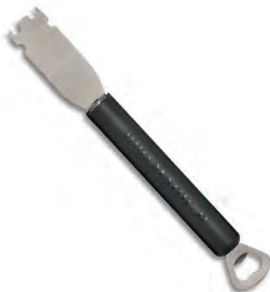
GS-01 GRILL SCRAPER