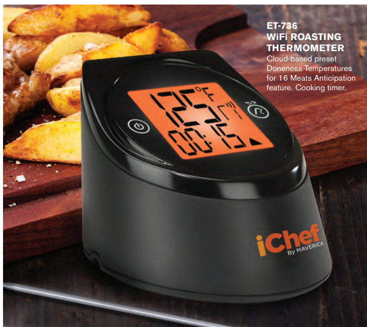
ET-736 WiFi ROASTING THERMOMETER Cloud-based preset Doneness Temperatures for 16 Meats Anticipation feature. Cooking timer.

Maverick is the inventor of the remote digital thermometer. We offer remote thermometers from opening price points to highly sophisticated units that have two probes: one to monitor food and another to monitor the BBQ. Both have alerts when the BBQ is out of the preset temperature range. Ask us about our outstanding line of App-driven digital smart cooking & BBQ thermometers including Bluetooth and WiFi powered units.