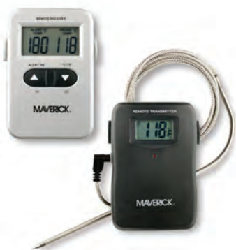
ET-710S SINGLE PROBE REMOTE THERMOMETER 100 Ft Range Shows Set and Actual Temperature +14°F to +410°F / -10°C to +210°C