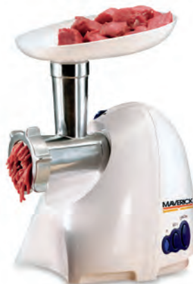
MM-5501 DELUXE MEAT GRINDER Reversible Motor / 550 Watts Auto Reset