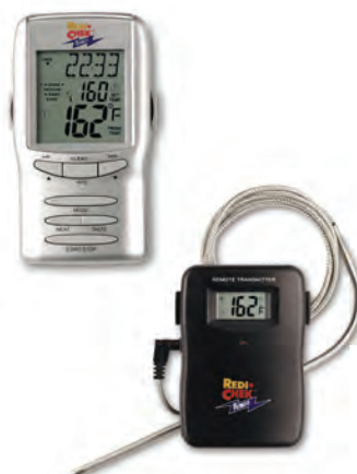
ET-72 SINGLE PROBE REMOTE THERMOMETER 100 Ft Range Selection of Meat and Taste Timer Included +14°F to +410°F / -10°C to +210°C