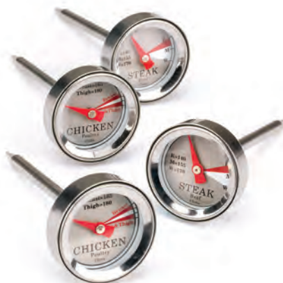
RT-04 SET OF FOUR STEAK & CHICKEN MINI THERMOMETERS