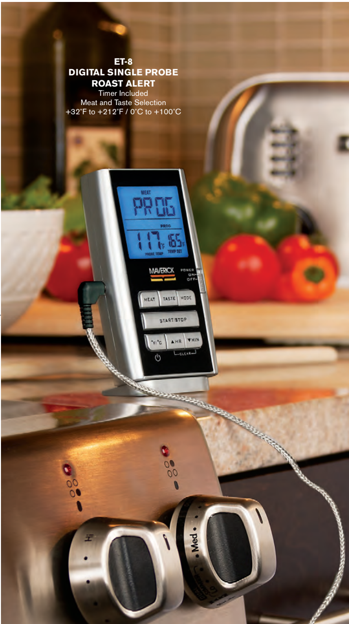
ET-8 DIGITAL SINGLE PROBE ROAST ALERT Timer Included Meat and Taste Selection +32°F to +212°F / 0°C to +100°C