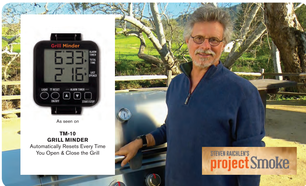
TM-10 GRILL MINDER Automatically Resets Every Time You Open & Close the Grill