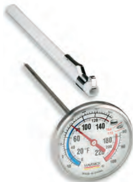
IRT-02 LARGE DIAL INSTANT READ 2" DIAL WITH SLEEVE 0°F to +220°F / -10°C to +100°C