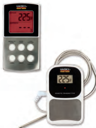
ET-632 WIRELESS BBQ THERMOMETER SET 300 Ft Range 1 Probe for Meat Temperature 1 Probe for Grill Temperature 0°F to +572°F / 0°C to +300°C