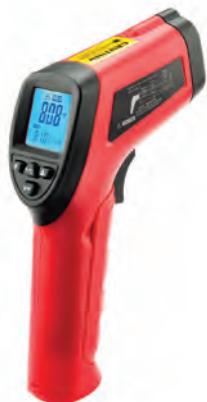
LT-04 LASER INFRARED THERMOMETER Accurate up to 5 Feet -44°F to +1022°F / -42°C to +550°C