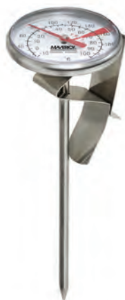
BT-01 INSTANT READ BEVERAGE & FROTHING THERMOMETER Quick Check Temperatures for Hot Drinks and Frothing Pitchers +32°F to +220°F / 0°C to +104°C