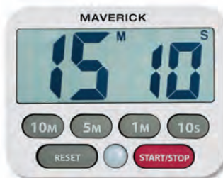
TM-200 LARGE DISPLAY TIMER WITH EXTRA LOUD ALERT Easy-To-Read Large Display 99 Minute, 59 Second Timer