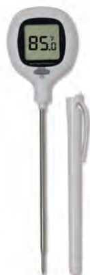
DT-15 ULTRA THIN PROBE THERMOMETER Pre Programmed for 5 Types of Meats -4°F to +482°F / -20°C to +250°C