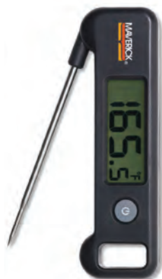
DT-05C-BLACK DIGITAL PROBE THERMOMETER Fold Out Instant-Read -4°F to +329°F / -20°C to +200°C