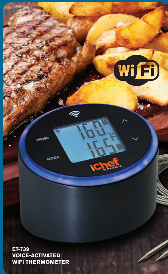
ET-739 VOICE-ACTIVATED WiFi THERMOMETER

iOS and Android Compatible Voice-Activated with Alexa Bluetooth-Enabled. Comes with 2 Probes +32°F to +572°F / +0°C to +300°C