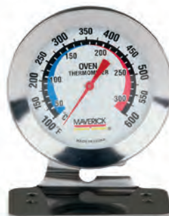
OT-02 LARGE DIAL OVEN THERMOMETER Color Coded Dial +100°F to +600°F / +50°C to +300°C