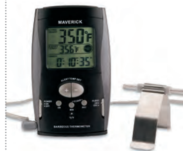
OT-3BBQ DIGITAL BARBECUE THERMOMETER LCD Shows Grill Temperature +122°F to +572°F / +50°C to +300°C