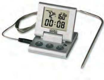
ET-807C FLIP UP DIGITAL ROASTING Timer Included +32°F to +482°F / 0°C to +200°C