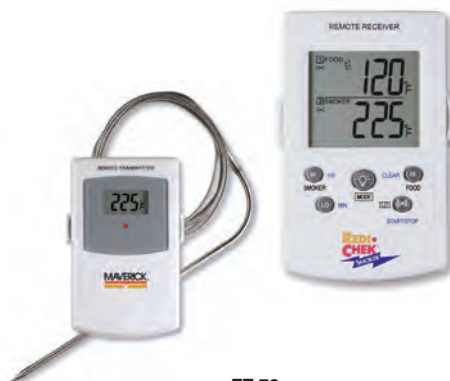
ET-73 REMOTE SMOKER THERMOMETER 100 Ft Range • Dual Probes Smoker Temperature and Food Temperature Min / Max Programmable +14°F to +410°F / -10°C to +210°C Also Available in Black