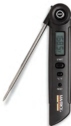
DT-13 FLIP TIP INSTANT READ +32°F to +572°F / 0°C to +200°C