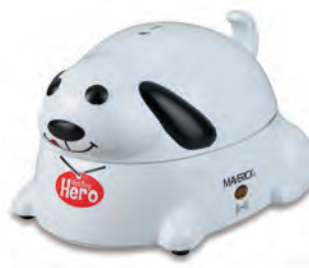
HC-01 HERO HOT DOG STEAMER Cooks up to Seven Hot Dogs Dog Barks when Hot Dogs are Ready