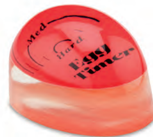
TM-100 IN WATER EGG TIMER