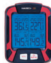
XR-50 EXTENDED RANGE WIRELESS BBQ & MEAT THERMOMETER

500 Ft Range With Insta-Sync™ Technology Four High Heat Probes for BBQ and Food +32°F to +572°F 0°C to +300°C