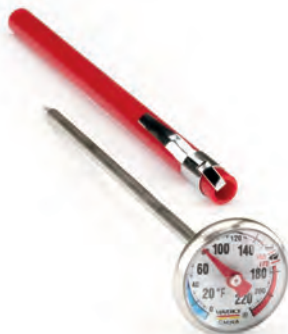
IRT-01 INSTANT READ 1" DIAL WITH SLEEVE 0°F to +220°F / -10°C to +100°C