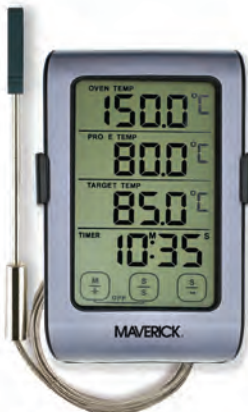
ET-851 DUAL SENSOR OVEN ROASTING DIGITAL THERMOMETER / TIMER New Large Touch Screen -14°F to +572°F / -26°C to +300°C