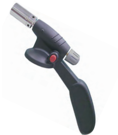
PL-8032C PROPANE TORCH Works with US 1" Thread Propane Gas Cylinder Easy Grip Handle