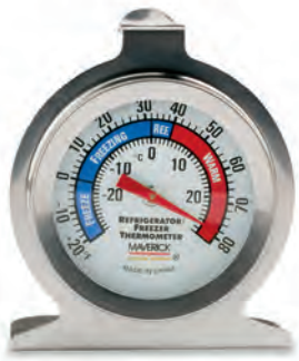
RF-01 REFRIGERATOR/FREEZER THERMOMETER Color Prompt Dial -20°F to +80°F / -10°C to +15°C