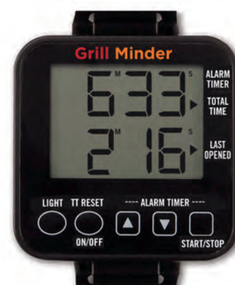
TM-10 GRILL MINDER Automatically Resets Every Time You Open & Close the Grill