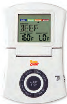
ET-88 PROMOTIONAL DIGITAL ROAST Meat Selection +32°F to +212°F / 0°C to +100°C