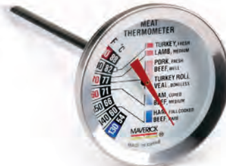
RT-03 GOURMET ROASTING THERMOMETER Large Color Coded Dial +130°F to +190°F / +54°C to +90°C