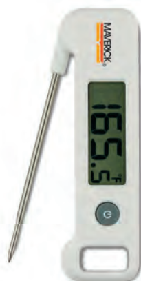
DT-05 DIGITAL PROBE THERMOMETER Fold Out Instant-Read -4°F to +329°F / -20°C to +200°C