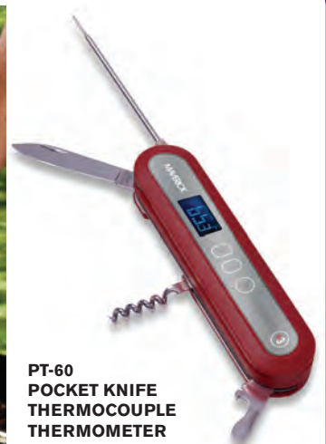
PT-60 POCKET KNIFE THERMOCOUPLE THERMOMETER + 3 TOOLS

Stainless Steel Instant-Read +4°F to +572°F / +4°C to +300°C