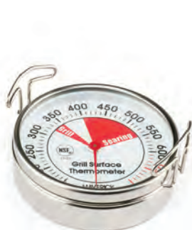
ST-01 SURFACE THERMOMETER NSF Approved • Color Dial +150°F to +700°F