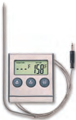
ET-808C DIGITAL ROASTING THERMOMETER Timer Included +32°F to +482°F / 0°C to +200°C