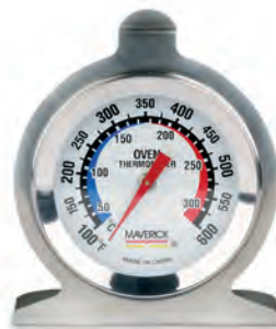
OT-01 OVEN THERMOMETER Color Coded Dial +100°F to +600°F / +50°C to +300°C