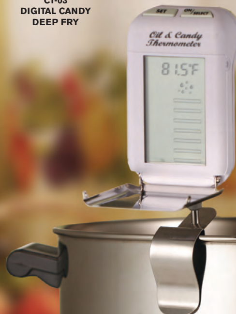
CT-03 DIGITAL CANDY DEEP FRY