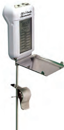
CT-03 DIGITAL CANDY/DEEP FRY 14 Pre-Programmed Settings +32°F to +392°F / +0°C to +200°C