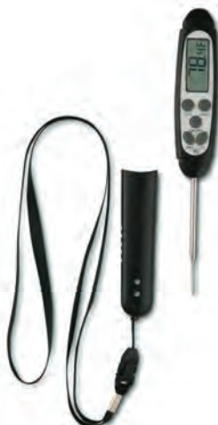
DT-09C FAST READ DIGITAL PROBE Handle and Protective Sleeve Waterproof • 1.7mm Tip -58°F to +572°F / -58°C to +300°C Also Available in Red